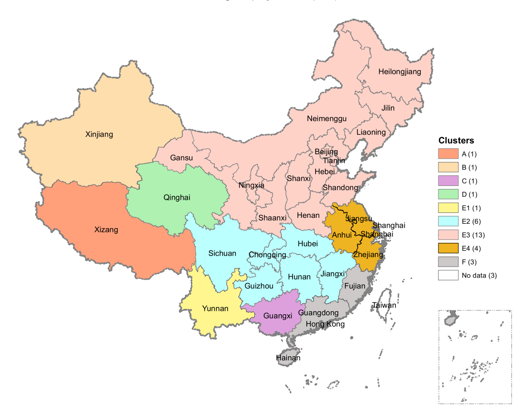
Fig. 3. Map of China showing locations of all provinces, where the provinces in one cluster share the same color. Note the number of provinces in each group is listed in the brachet following the corresponding label.